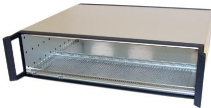
pic. 3: casing design 19"rack mount version