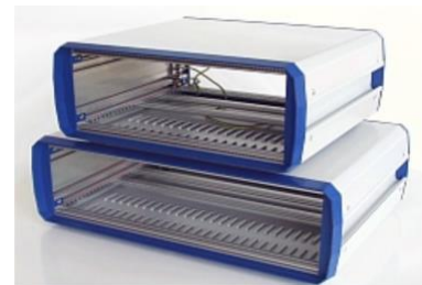
pic. 4: table top casings 63TE and 84TE