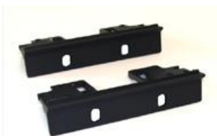
pic. 5: L-brackets for 19-rack mount casing E-103-921