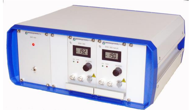
pic. 1: ENV system based on 63TE table top casing